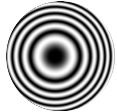
Figure 3: Power interferogram