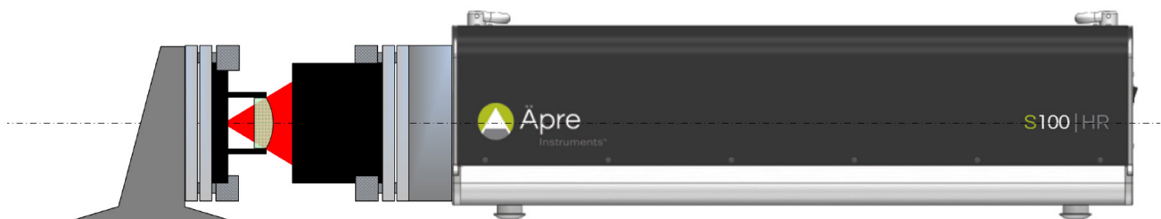
Figure 2: Basic Setup for measuring a convex sphere